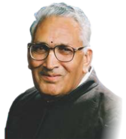
Founder and Guiding Light