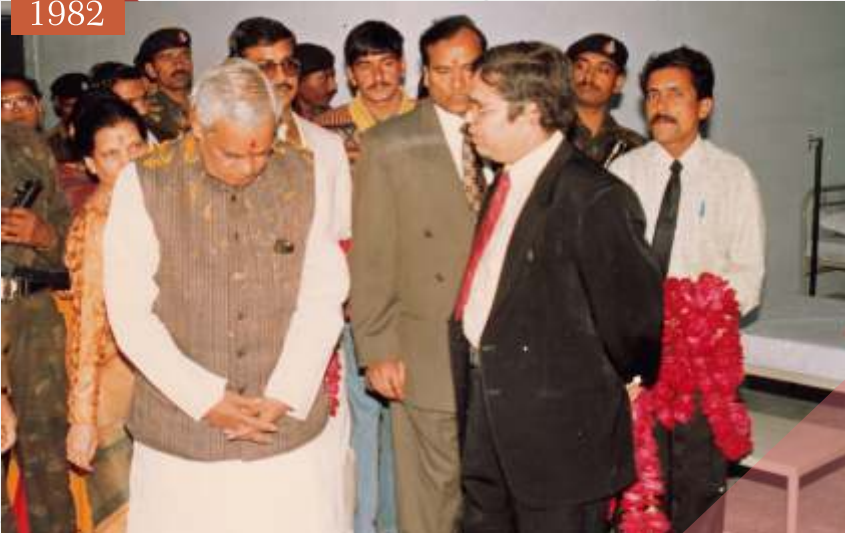
Swasthya Kalyan Hospital inaugurated by Shri Atal Bihari Vajpayee, former Prime minister of India