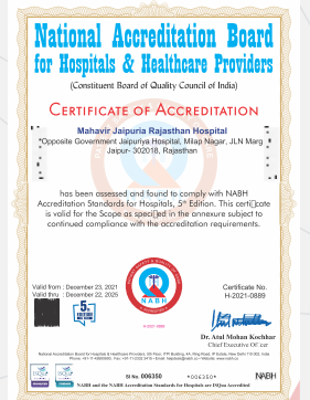
RHL is now NABH Accredited