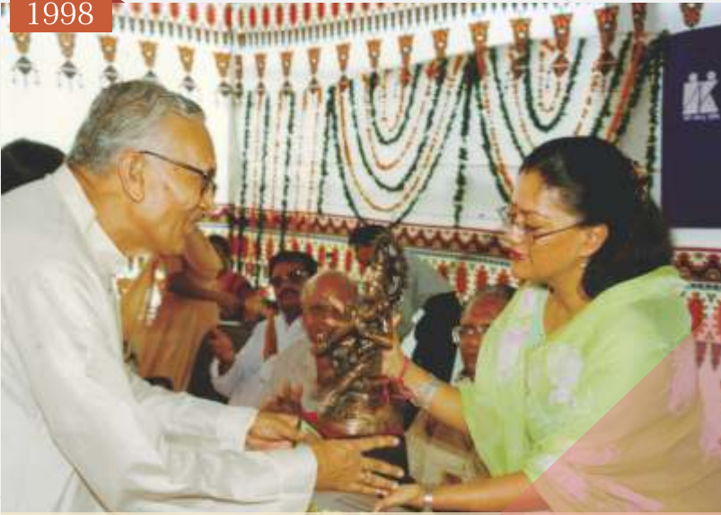
First Nursing School of Rajasthan inaugurated by Smt. Vasundhara Raje, Chief Minister of Rajasthan