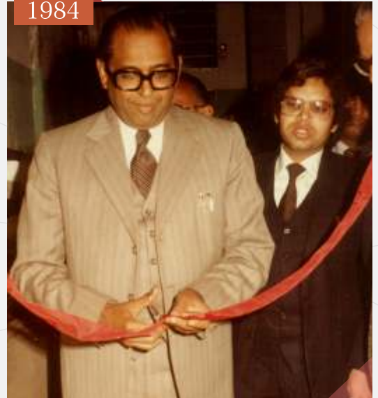
First PPP Mode X-Ray Machine in Rajasthan inaugurated by Justice Suresh Chand Agarwal