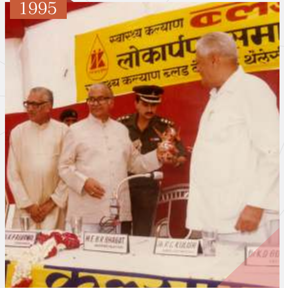
Blood Bank Inaugurated by Honorable Governor of Rajasthan Shri Bali Ram Bhagat