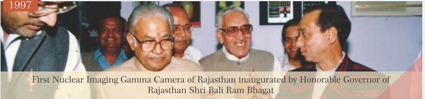
First Nuclear Imaging Gamma Camera of Rajasthan inaugurated by Honorable Governor of Rajasthan Shri Bali Ram Bhagat