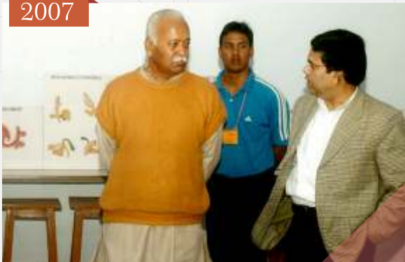
Shri Mohan Bhagwat ji at Campus