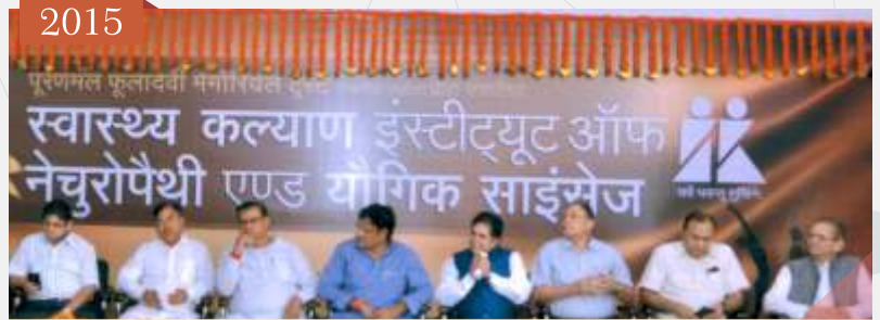
Swasthya Kalyan Institute of Naturopathy and Yogic Sciences inaugurated by Shri Shripad Yesso Naik, AYUSH Minister of India and Shri Rajendra Rathore, Health Minister of Rajasthan