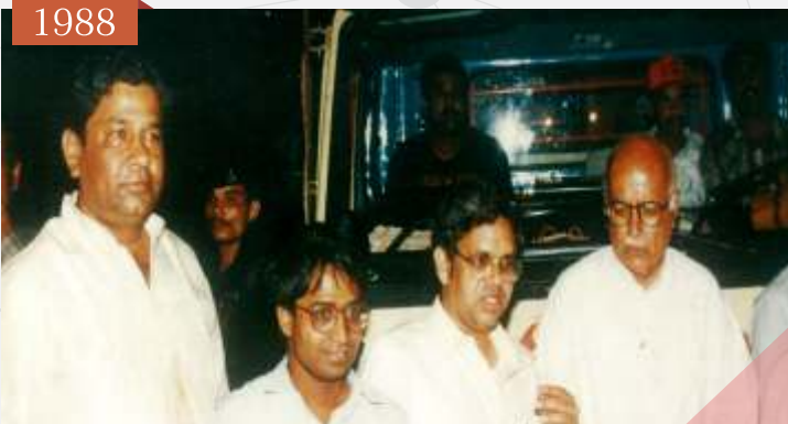
First private ambulance services in Rajasthan, inaugurated by Shri Lal Krishan Advani and Shri Ghanshyam Tiwari