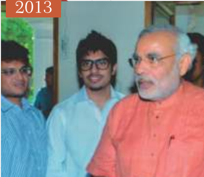
Blood Bank poster vimochan by Shri Narendra Modi, then Chief Minister of Gujrat