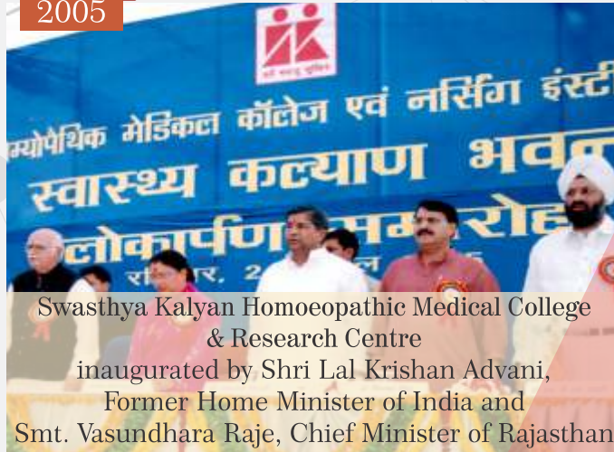
Swasthya Kalyan Homoeopathic Medical College & Research Centre inaugurated by Shri Lal Krishan Advani, Former Home Minister of India and Smt. Vasundhara Raje, Chief Minister of Rajasthan